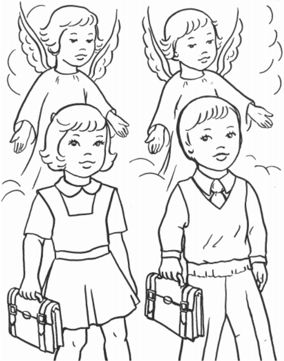
Our Guardian Angels